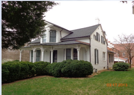
On Wings Office in Old Salem