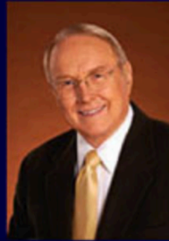
Dr. James Dobson

"I think it is a disgrace that half the Christians in America aren't even registered to vote, and of those who are, only half go to the polls...When we withhold our influence and participation, we yield by default to those who promote immoral and destructive policies."