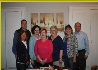
OWLAD Board Members: