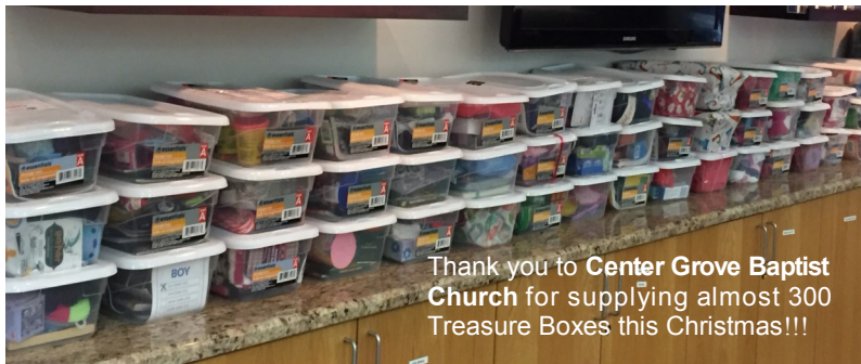
Thank you to Center Grove Baptist Church for supplying almost 300 Treasure Boxes this Christmas!!!